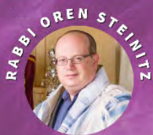
Congregation Beth Shalom - Chevra Shas

Conversion to Judaism Not What you Learned in Hebrew School